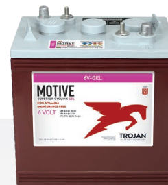
MOTIVE 6-VOLT GEL