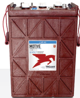
RUGGED MOTIVE 6-VOLT