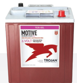
MOTIVE 6-VOLT GEL