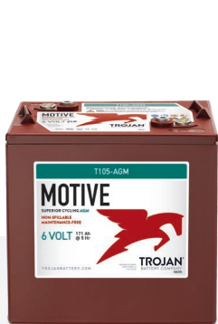
MOTIVE 6-VOLT AGM