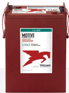
MOTIVE 12-VOLT AGM