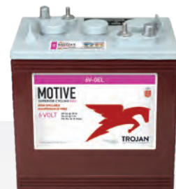
MOTIVE 6-VOLT GEL