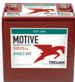
MOTIVE 8-VOLT AGM