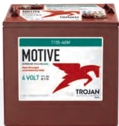
MOTIVE 6-VOLT AGM