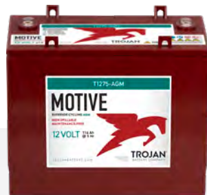
MOTIVE 12-VOLT AGM